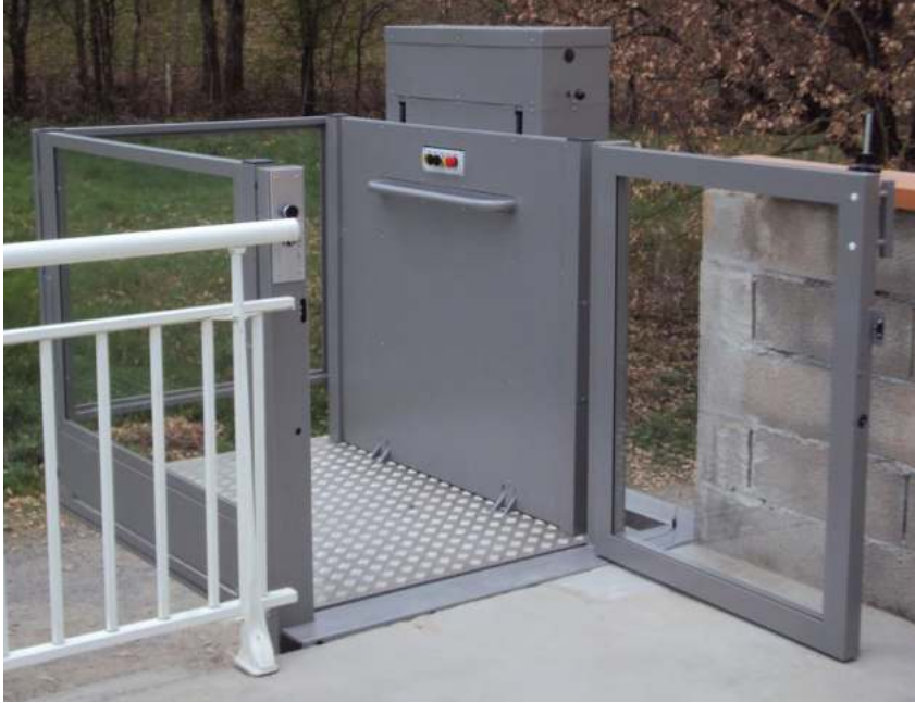
Upper gate can be manual or automatic