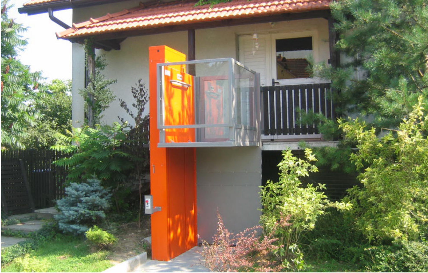
Special RAL colour for parts of the lift installation