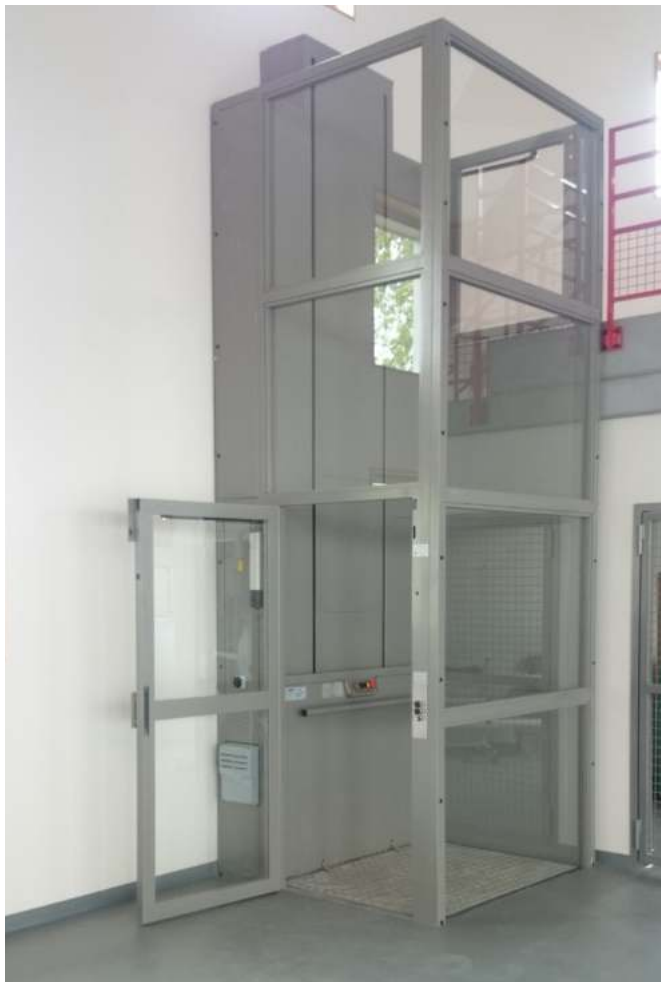
Glas shaft with steel or aluminium frame as an option