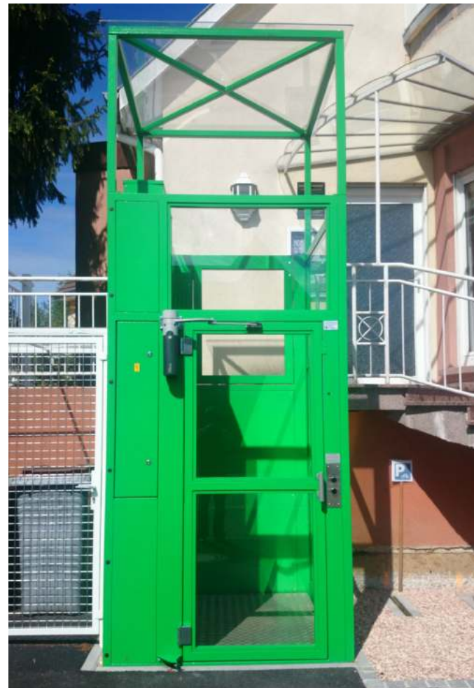
Glas shaft with roof and special colour

Especially designed for outside installation, the double-chain drive and the robust electrics provide for a safe drive and a low-maintenance operation.