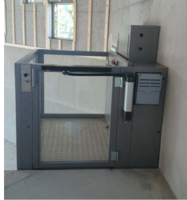
Upper gate with automatic door opener