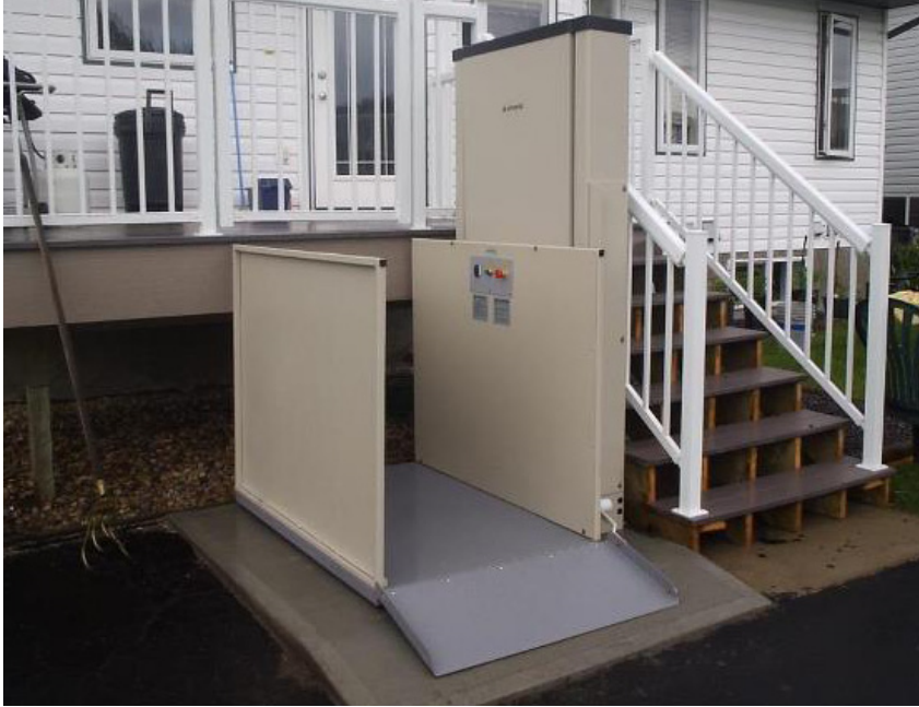
Upper gate integrated into balustrade