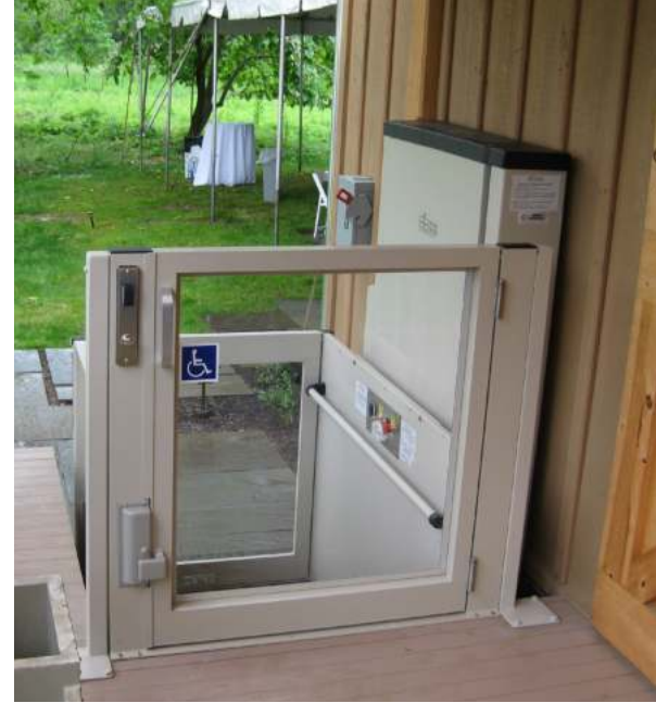
Upper gate with plexiglass insert